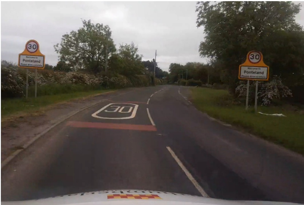
Image travelling southbound showing beginning of 30mph speed limit north of Jameson Estate